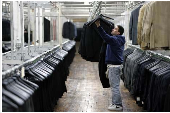
A worker hangs suits in the distribution center at the Joseph Abboud garment manufacturing plant in New Bedford, Mass. Male job seekers may want to stick with a formal business suit these days, experts say.

Given tough economy, formal business attire now required at interviews